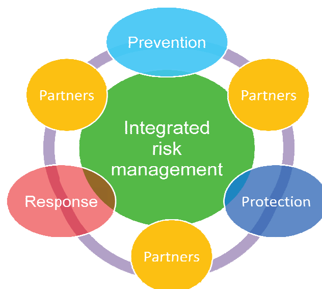
Figure 2 Surrey Fire and Rescue Service integrated risk management

This integrated approach to the management of risk is not solely dependent on the fire service. We work with a wide range of partners on a statutory basis as well as those in the private and voluntary sector (see figure 2 below)